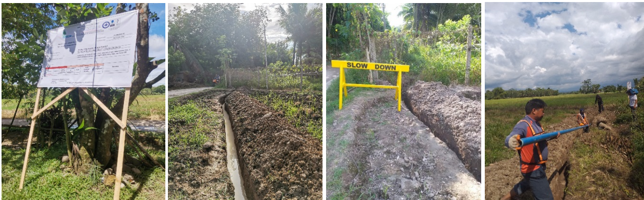
Purok 5-7, Amazon Distribution Line, Kidapawan City