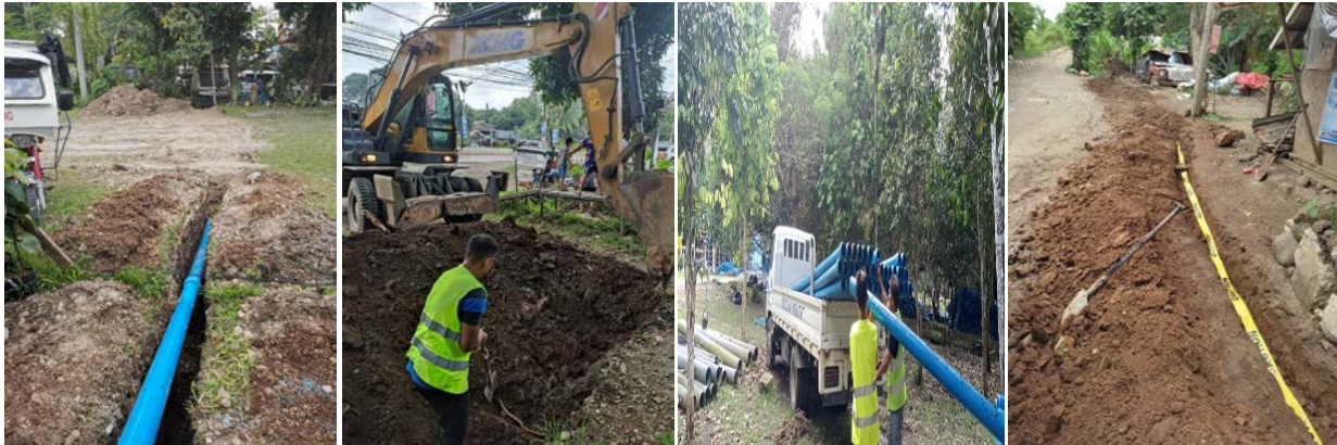
Dawn's Café to Pepperbird Mainline, Kidapawan City