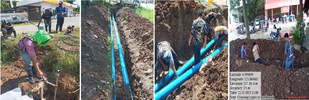
Crossing Lopez St. to Landmark Mainline, Kidapawan City