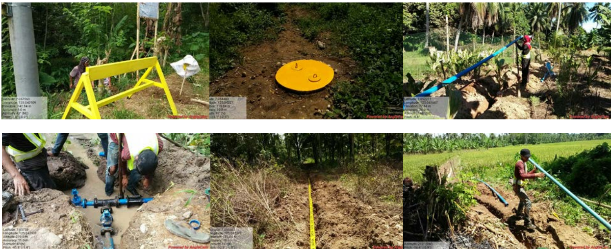
Purok 5 Distribution Line, Sikitan, Kidapawan City