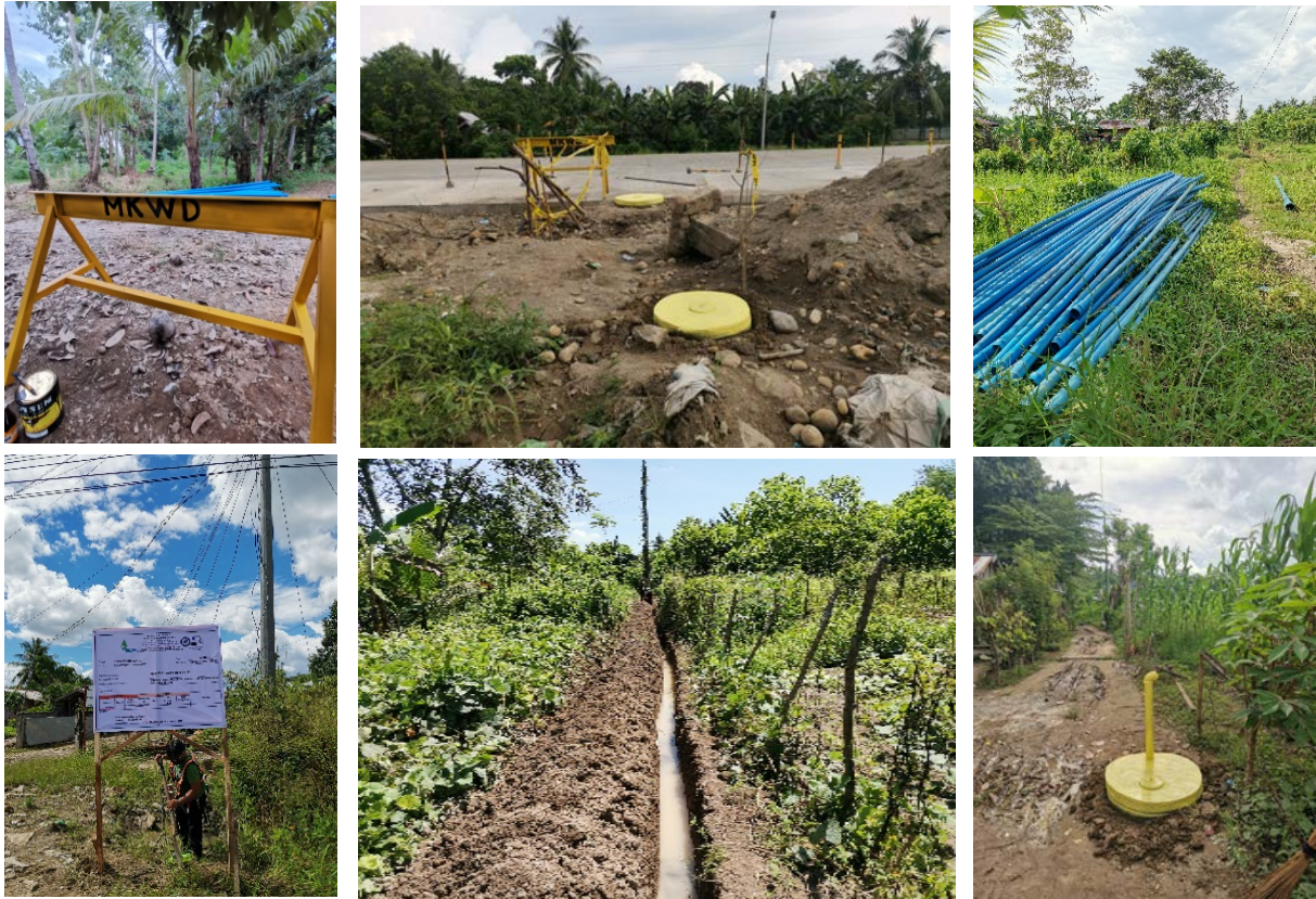
Purok 2 Binoligan Distribution Line, Kidapawan City