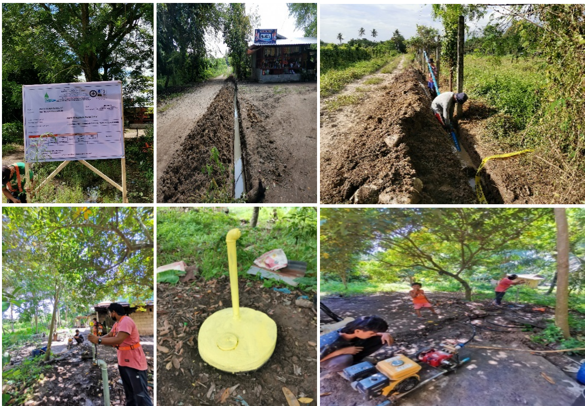
Purok 1 Binoligan Distribution Line, Kidapawan City